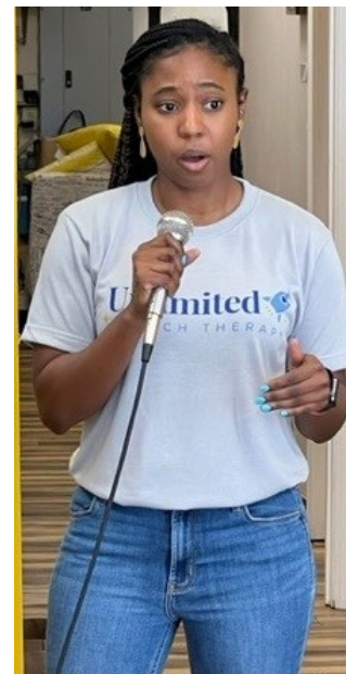
Columbia Area Speech Pathologist offers support to individuals and families regarding IEP and available services