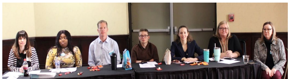
SOS Program participate in Panel Discussion for Partners in Policymaking®