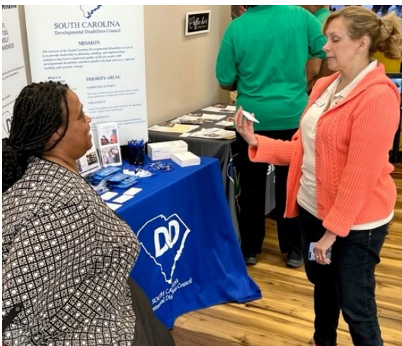
Northeast Columbia Empowerment Coalition Team