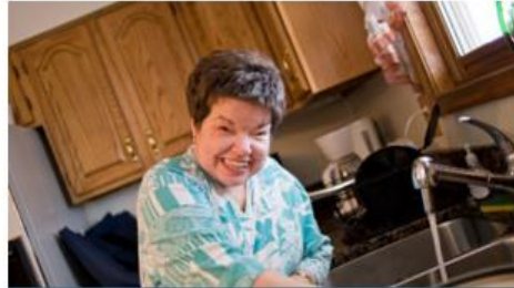
Person with I/DD