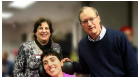
Other Family or Friend