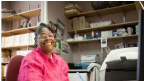
Staff at Chapter of The Arc