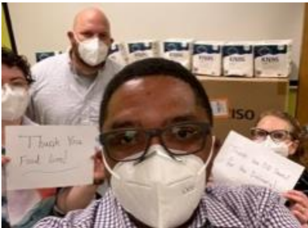
Image above: Four people wearing masks holding thank you messages to Food Lion for their donation.