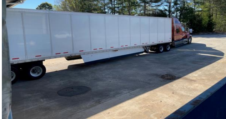
Image: A red and white tractor trailer