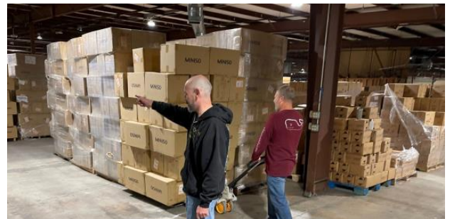
Image below: A man in a red shirt pulls a pallet of masks, while a man in a black hoodie points off camera